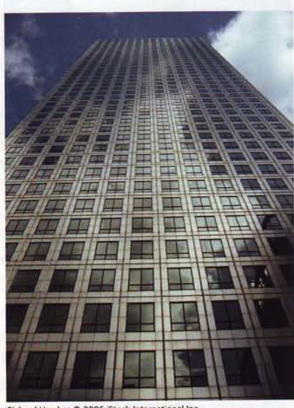
Richard Hawkes © 2006 iStock International In-

24,000 HECTARES OF LONDON ROOFS REVAMPED INTO ECOLOGICAL REAL ESTATE