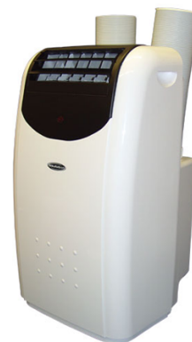
CODAR Product Code AC-ROOM1†